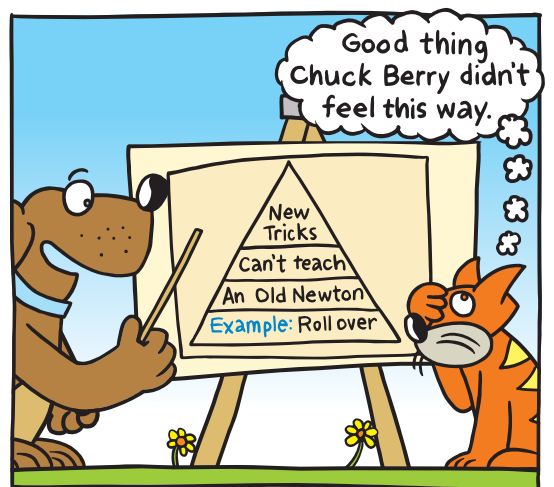
"I hope my owner sees my summary triangle. I just can't seem to learn 'roll over'."